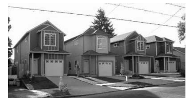
"Which house hides the hungry family?"

Harvest. Tell your friends, co-workers, and fellow parishioners that you give your time, your food, and/or your funds... Others may then be more inclined to ask questions about how to access food. It seems that we also must listen better to what people are really saying, to notice what is happening in their lives, and to discreetly support them in any way we can. Because we truly have neighbors who are going hungry, and we don't even know.